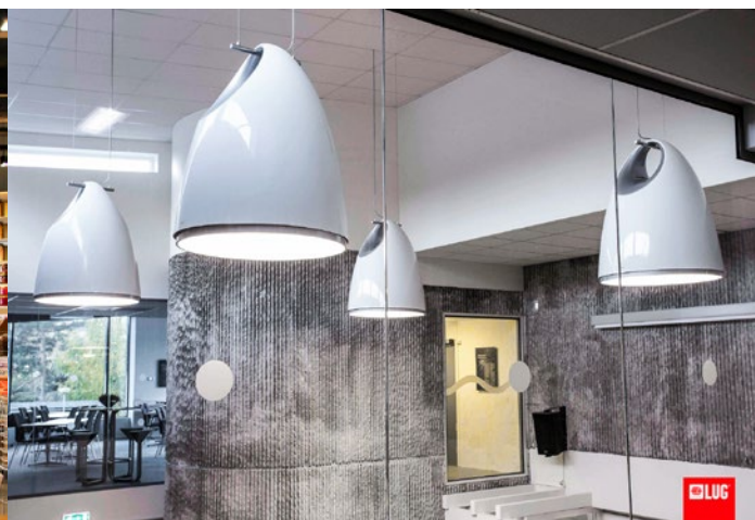
Frikirken Church, Norway