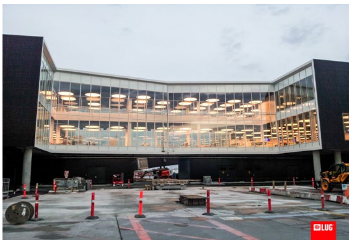
Kastrup Airport, Copenhagen, Denmark